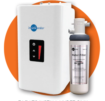
EASY TO INSTALL UNDER SINK TANK & WATER FILTER