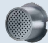
Activated Charcoal Filter Part no.: 3988129100

° = Measurements taken at +25°C ambient and +12°C interior temperature tested by Liebherr Germany (not to Australian standards).